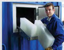
Container + Block ice