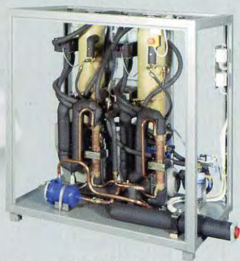
UBE 5.000 R = UBE 5.000 E