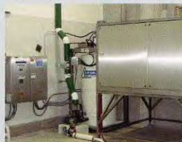
Ice Dosing Systems