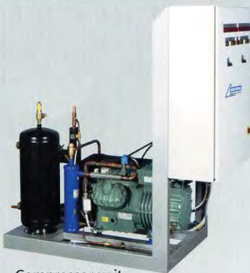
+ Compressor unit