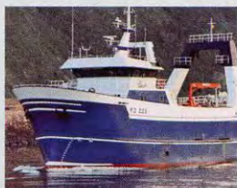
On board Machines